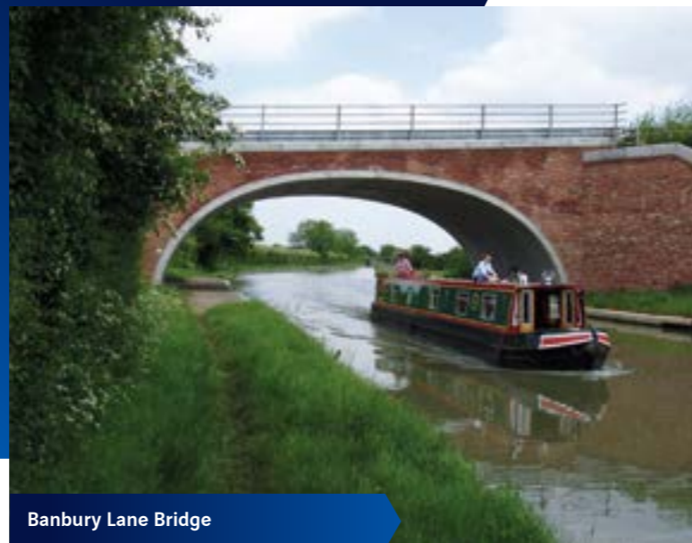
Banbury Lane Bridge

Reinforced Earth® panels combined with proper backfill materials ensure adequate drainage, especially if the structure may be subjected to sudden rapid draw down and other variations in water level.